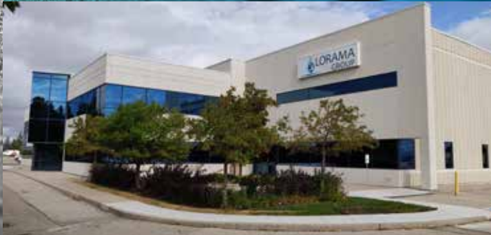
Lorama Group Manufacturing Facility, Canada

DISCLAIMER : The information given and the recommendations made herein are based on our research and are believed to be accurate but no guarantee of their accuracy is made. In every case, we urge and recommend purchasers, before using any product in full-scale production, to make their own tests to determine to their own satisfaction whether the product is of acceptable quality and is suitable for their particular purposes under their own operating conditions. The products discussed herein are sold without any warranty as to merchantability or fitness for a particular purpose or any other warranty, expressed or implied. No representative of ours has any authority to waive or change the foregoing. Nothing contained herein shall be construed to imply the non-existence of any relevant patents or to constitute a permission, inducement or recommendation to practice any invention covered by any patent, without authority from the owner of the patent. November 2023.