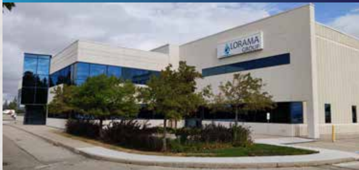
Lorama Group Manufacturing Facility, Canada

Email: colourfal@lorama.com www.colourfal.com